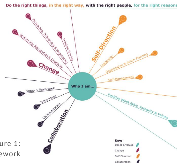
Figure 1: The ChANGE Framework

Work has already been completed to write 'headline' statements at Level 6 for our 10 employability skills (capabilities and behaviours), as well as for the 3 categories shown in Figure 1, namely Change, Self-Direction and Collaboration. Each of these 3 categories has 3 associated skills and the final skill – positive work ethic, integrity and values, sits at the heart of the model. These 10 skills match those in use in our Employability Plus scheme, although the associated definitions and wording are much broader than more typical definitions. This is because our definitions incorporate earlier research conducted by the Institute of Learning and Teaching with staff and students, to understand what it means to be a Changemaker.