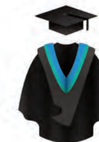
Postgraduate Certificate in Education