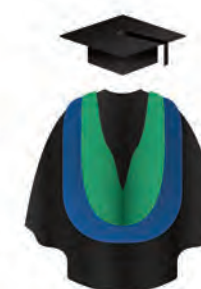
Certificates & Diplomas of Higher Education