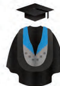
Bachelor of Engineering