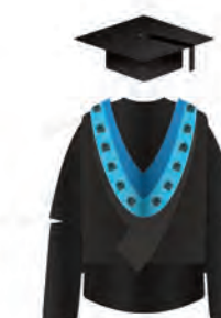
Master of Research