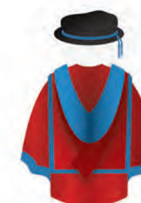
Doctor of Philosophy