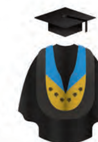
Bachelor of Business Administration