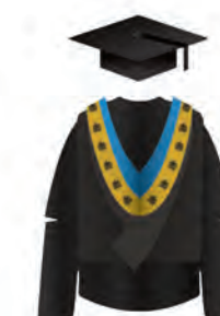
Master of Business Administration