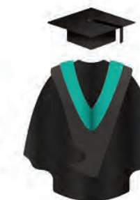
Postgraduate Certificates & Diplomas