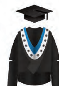
Master of Science