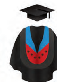
Bachelor of Arts