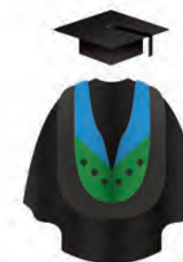
Bachelor of Laws