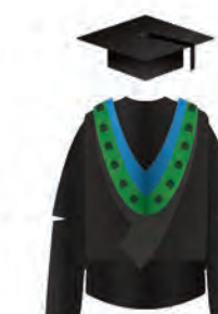
Master of Laws