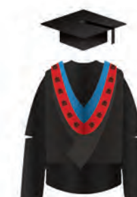
Master of Arts