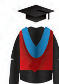
Master of Philosophy