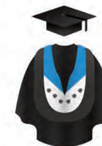
Bachelor of Science