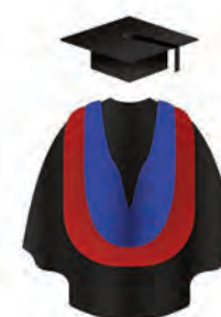
Higher National Certificates & Diplomas