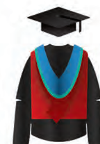
Postgraduate Diploma in Research