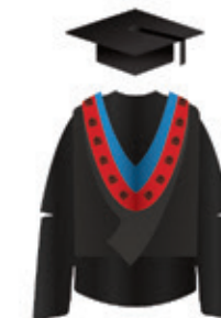
Master of Arts