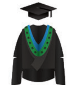
Master of Laws