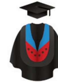
Bachelor of Arts