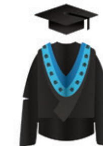
Master of Research