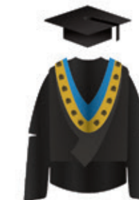
Master of Business Administration