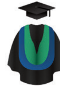
Certificates & Diplomas of Higher Education