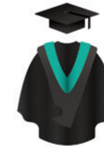
Postgraduate Certificates & Diplomas