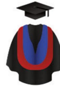
Higher National Certificates & Diplomas