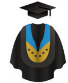
Bachelor of Business Administration