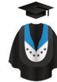
Bachelor of Science