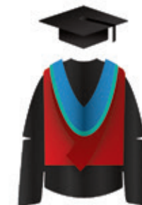
Postgraduate Diploma in Research