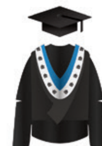
Master of Science