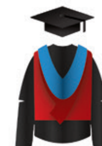
Master of Philosophy