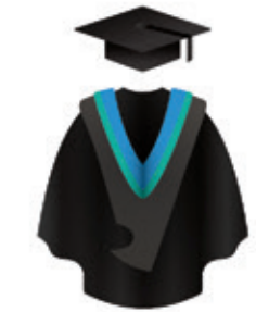
Postgraduate Certificate in Education