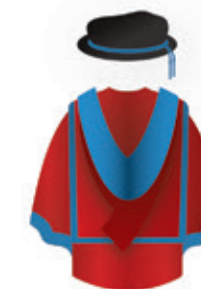
Doctor of Philosophy