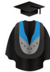
Bachelor of Engineering