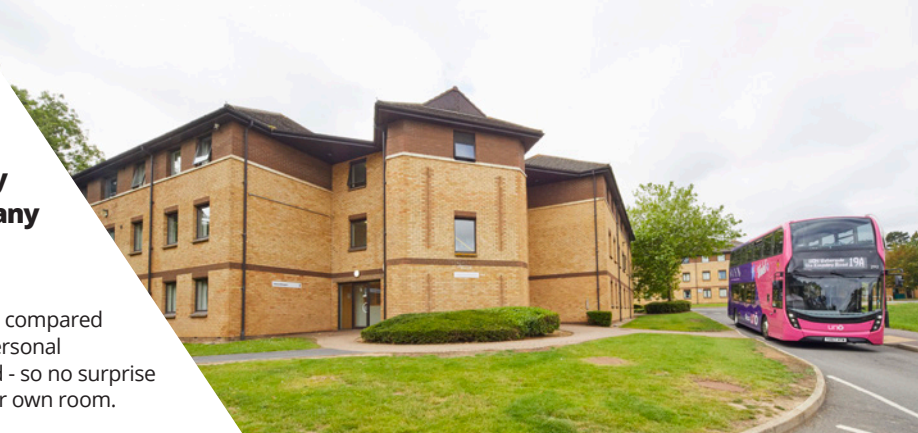
Scholar's Green Student Village