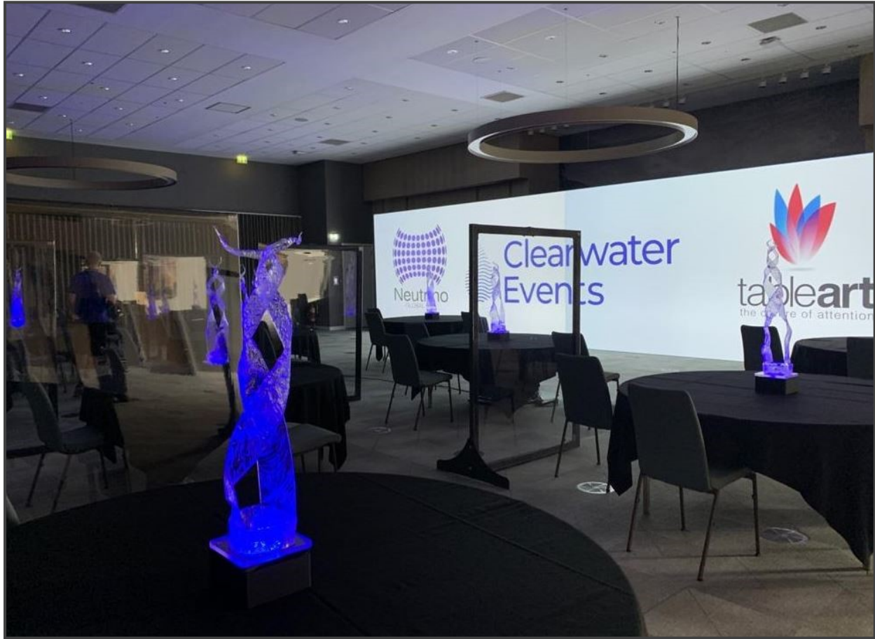
An example of a Covid-secure event venue layout.

The safety requirements in relation to Covid-19 are another layer on top of the already extensive health & safety considerations for events and, although restrictive in some ways, they have also led to innovative new ways of delivering events safely such as spaced outdoor 'pods' for music and comedy gigs and drive-in theatre performances. The challenge here is not just how to ensure compliance with the restrictions but how to make these adapted events financially viable. It is estimated by Stand Out Magazine that the additional cost for Covid-compliance is 10% of the event budget on top of pre-covid costs. Given the economic impacts of the pandemic, increasing prices will be challenging so there is a need for financial support for the sector to enable recovery and regain the £70bn annual economic impact of events in the UK. Similarly, these requirements have some significant consequences in terms of sustainability across the triple bottom line. The environmental impact of disposable PPE, disposable cups, and increased use of plastic is important in evaluating the viability of running an event in a Covid-safe way.